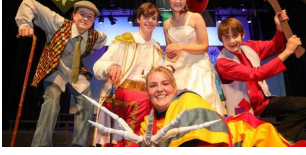
The Albury Gang Show

Congratulations to the Gang in Albury for having been first with the shows this year and for getting in the local paper !